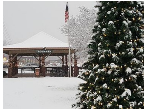
Enjoy our Downtown Depot on Main St. in Troutman. This is a replica of the original railroad Depot that served our area in the mid-1800's.